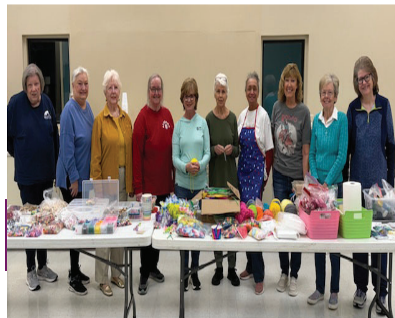
Operation Christmas Child Crafting Second Thursday of the Month. 10-Noon