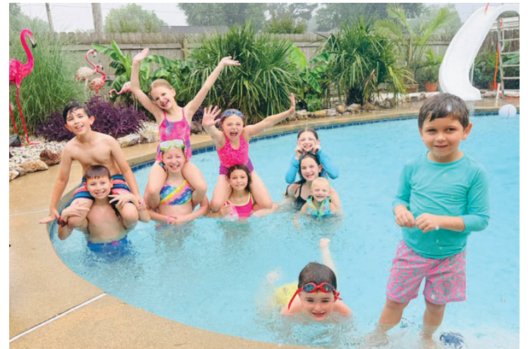
KIDS MINISTRY POOL PARTY FROM JUNE 7TH.